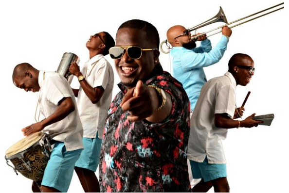
Tribu de Abrante

Instrumental in reclaiming the Puerto Rican Plena style of music for a new generation of listeners, Grammy-nominated Plena Libre brings it danceable, Afro-Rican groove to the Festival during the first weekend.